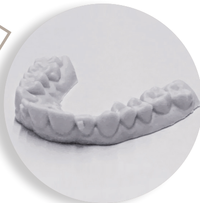
3D printing of the dentition arches