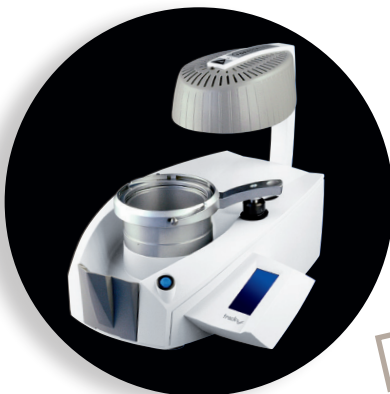
Thermoforming of aligners