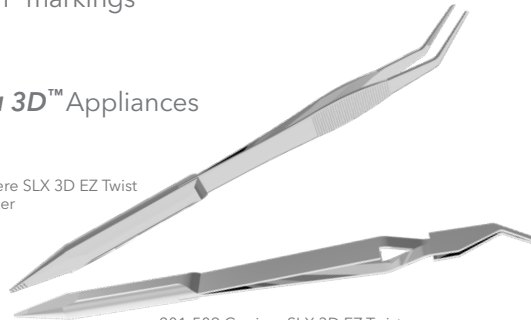
201-509 Carriere SLX 3D EZ Twist Opener Reverse Tweezer